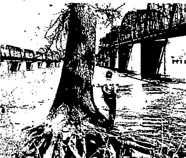
ILLUSION...Two bridges over the Mississippi River at Alton, Illinois, appear to run together, due to the old tree in the center of the photo.