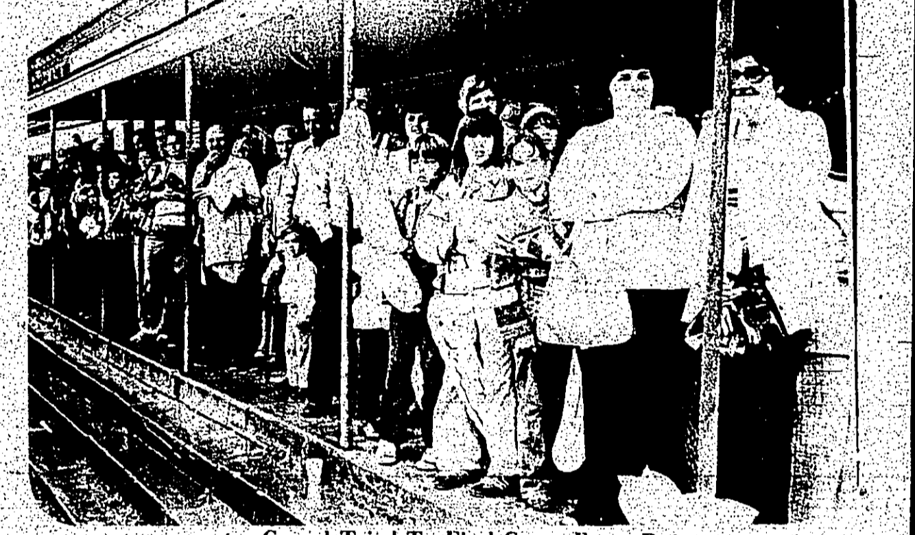
Crowd Tried To Find Cover From Rain