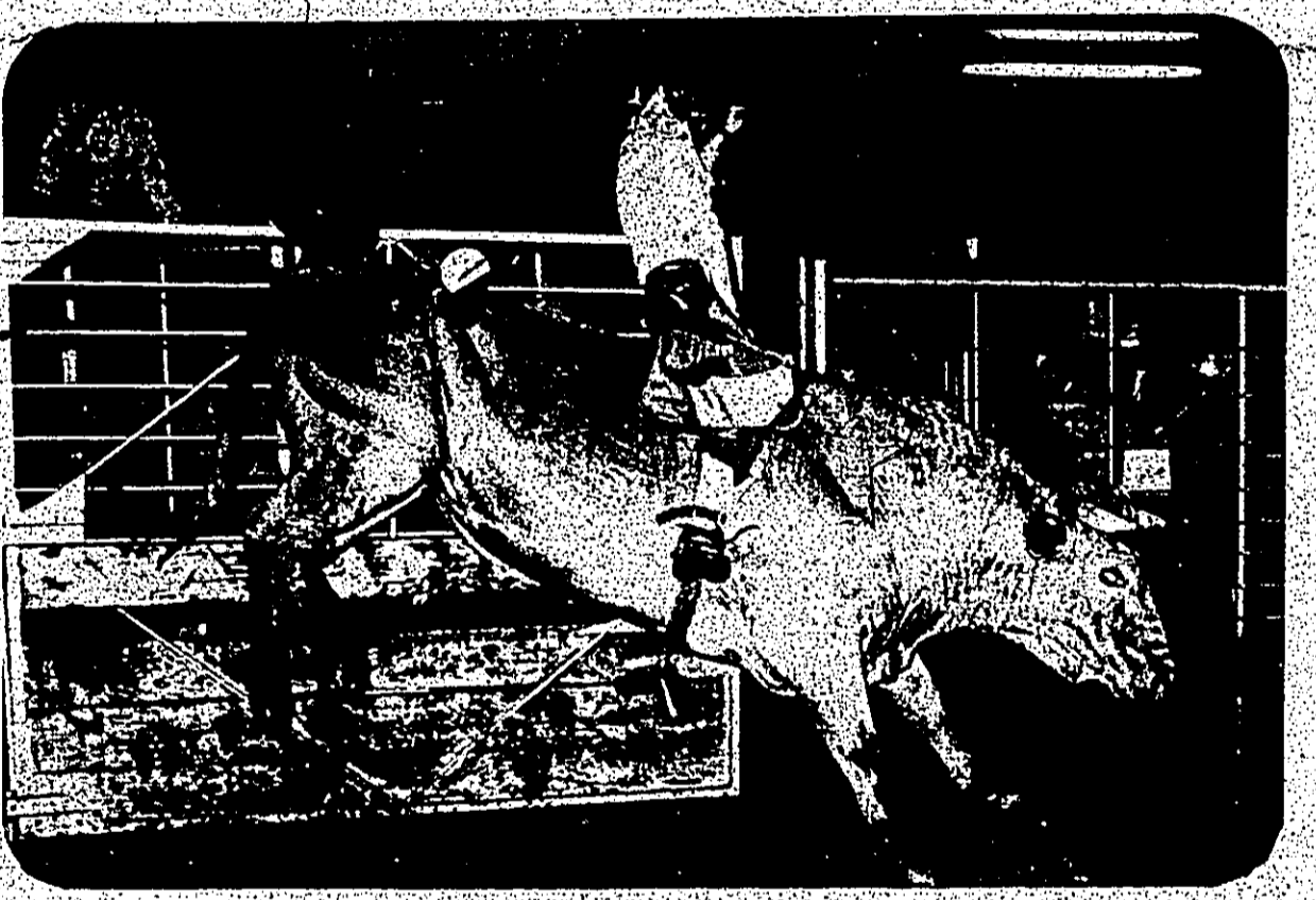
This Rider Is Wearing A Face Mask