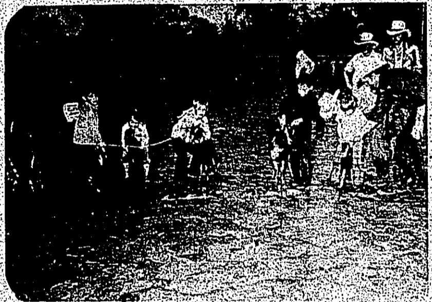
Western Week Rodeo Goat Scramblers Pose With 'Horns In Hands'

Tickets for the event may be obtained from the Tyler County Chamber of Commerce, 118 Pavilion Street, Woodville, Texas 75779, at various Woodville merchants, or at the amphitheater on April 2.