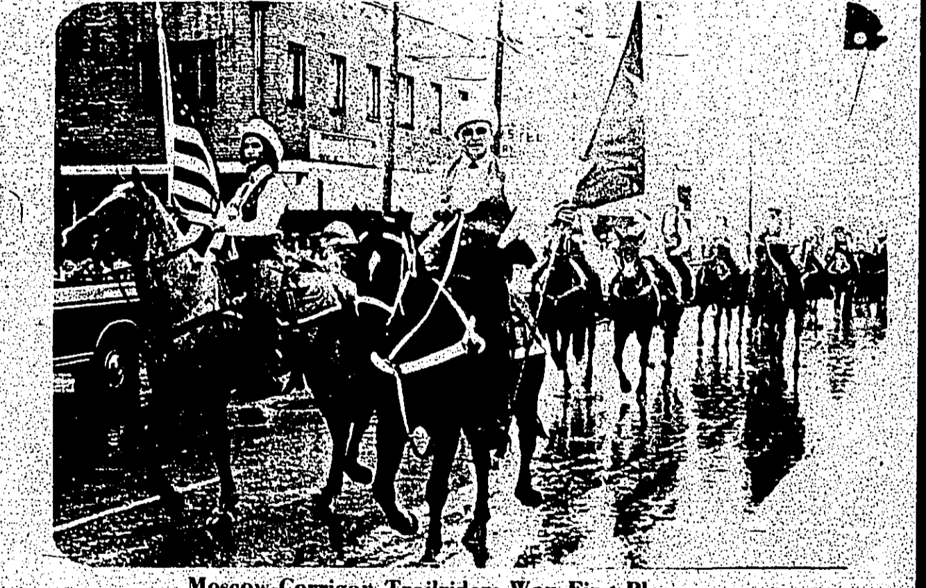
Moscow-Corrigan Trailriders Won First Place