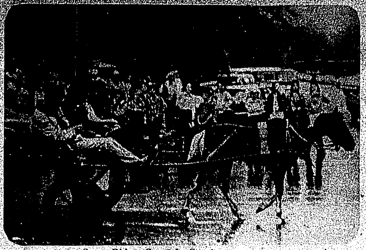
Some Riders Came In Comfort