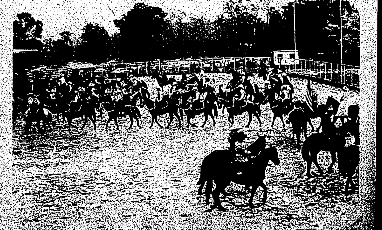
Grand Entry Provided Low of Color