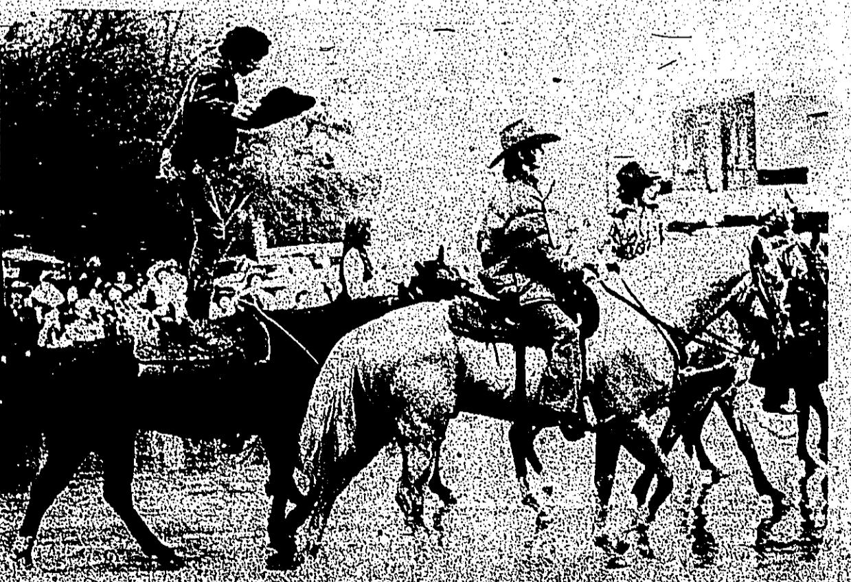
Trick Rider Got Attention On Saturday