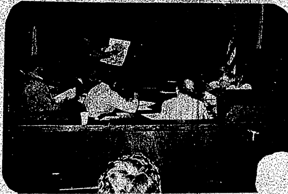
Planners Describe Jail Floorplan