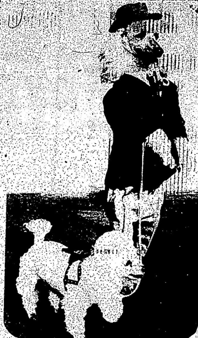
A beautiful display of ornately costumed poodles, Karl's Poodles are among highlights of the Stebbing Royal European Circus. The circus will appear in Woodville on Friday, April 22, with performances scheduled at 5:30 and 8:00 p.m. The red and white striped big top will be set up at Highway 69, South (South Magnolia Street). This year's circus visit is sponsored by the Woodville Lions Club to raise funds for civic activities.

Two years ago a trio of Royal Bengal Tigers were born on the circus while playing New York City, the first born in captivity to survive. They are now joined by a