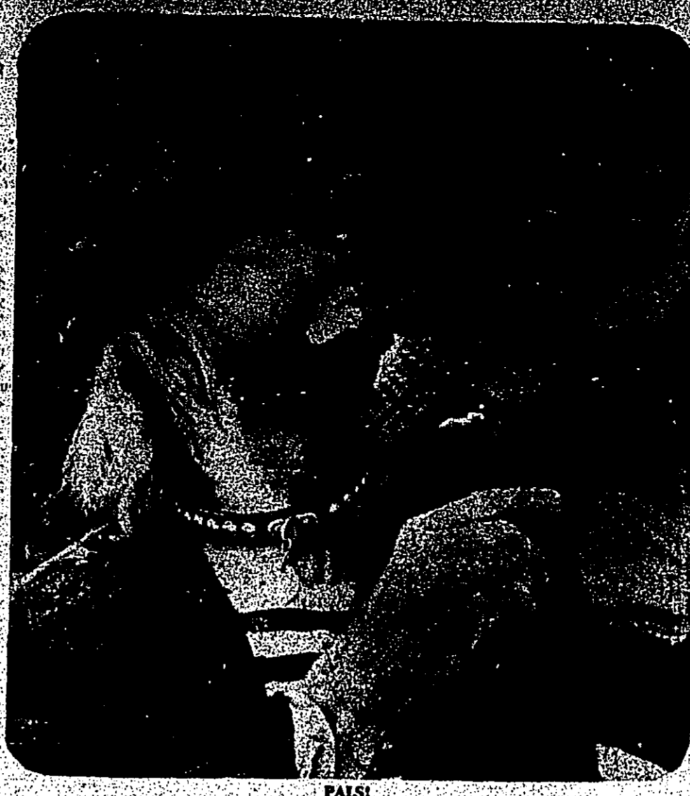
Roscoe the Clown and Tony the chimpanzee share a tender moment between performances of the Stebbing Royal European Circus. The circus comes to Woodville on Friday, April 22 with performances at 5:30 and 8:00 p.m. This year's circus is sponsored by the Lions Club to raise funds for their civic activities.