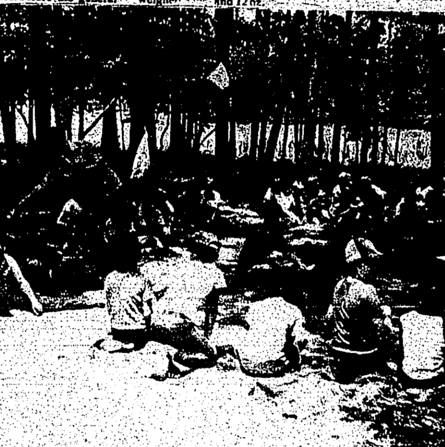
Cubs At Camp. CUB SCOUT DAY CAMP A SUCCESS—Woodville area Cub Scouts had a ball at the recent Cub Day Camp held at the Alabama Coushatta Indian Reservation last week.

Tyler County CB Club Inc. met for its regular meeting July 20 at 7:30 p.m. with 21 members and 2 visitors present. We were real happy to have Double Eagle and Lady Double Eagle with us and hope they can come again every club they get.