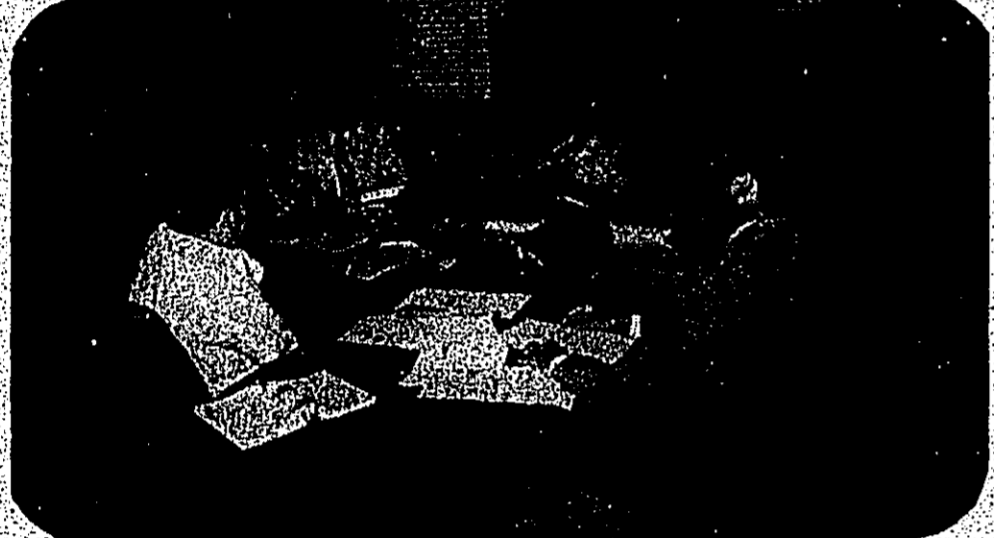
Council In Session Monday Night