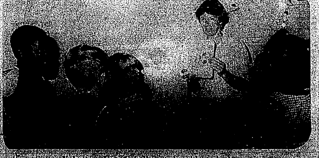
Volunteers joined together with students

Winners of the contest will be given a party. The membership drive begins Thursday and runs for the year. Read the letter your child brings home and see why you should be a member of the School Service League.