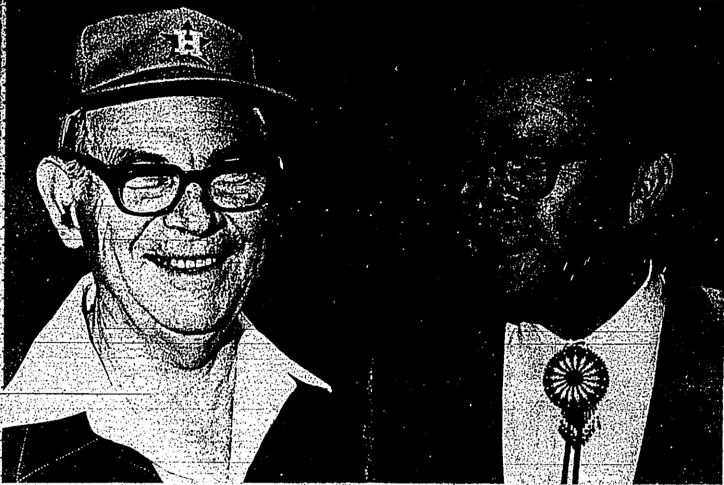
AGRICULTURE COMMISSIONER VISITS... Texas State Commissioner of Agriculture Reagan Brown (at right) visited the Deep East Texas Council of Governments meeting at the Lufkin Civic Center Friday and is shown discussing with Tyler County Judge Allan Sturrock the Fire Ant problem which plagues farmers in the East Texas area. According to Sturrock, Brown was only able to discuss the magnitude of the fire ant problem, but offered no advice on how to solve the dilemma.