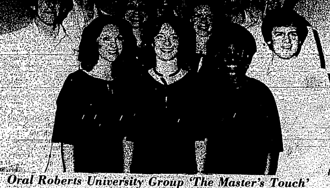
Oral Roberts University Group 'The Master's Touch'