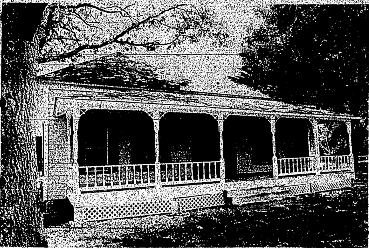
THE HOMESTEAD RESTAURANT TO OPEN SOON. Nestled in the shade of some Hillister oak trees, the Homestead Restau-