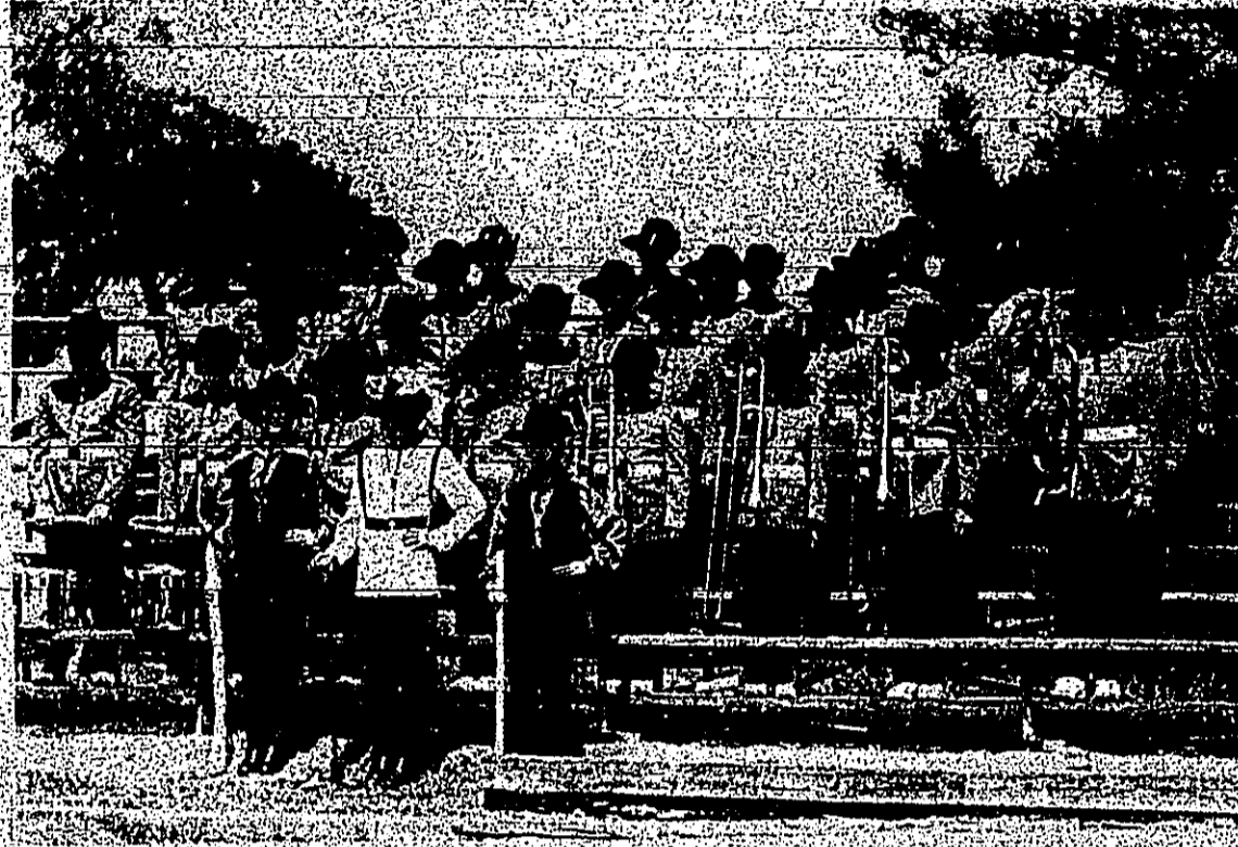
COLMESNEIL BAND: The Colmesneil High School Bulldog Marching Band posed for pictures last week and look as impressive as ever in their red and black uniforms.