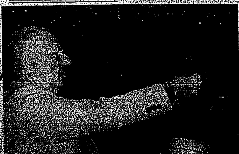
Earl McLaughlin, 74

PURSE LOST - Vicinity of South Magnolia Drive Inn. Valuable papers. Keep money, please return. Call 253-3227.