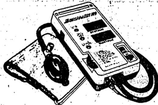
NO. 118 SunMark DIGITAL BLOOD PRESSURE/PULSE MONITOR