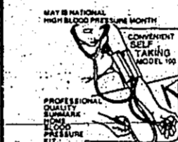
MAY IS NATIONAL BLOOD PRESSURE MONTH

PROFESSIONAL QUALITY BLOOD PRESSURE MONITOR