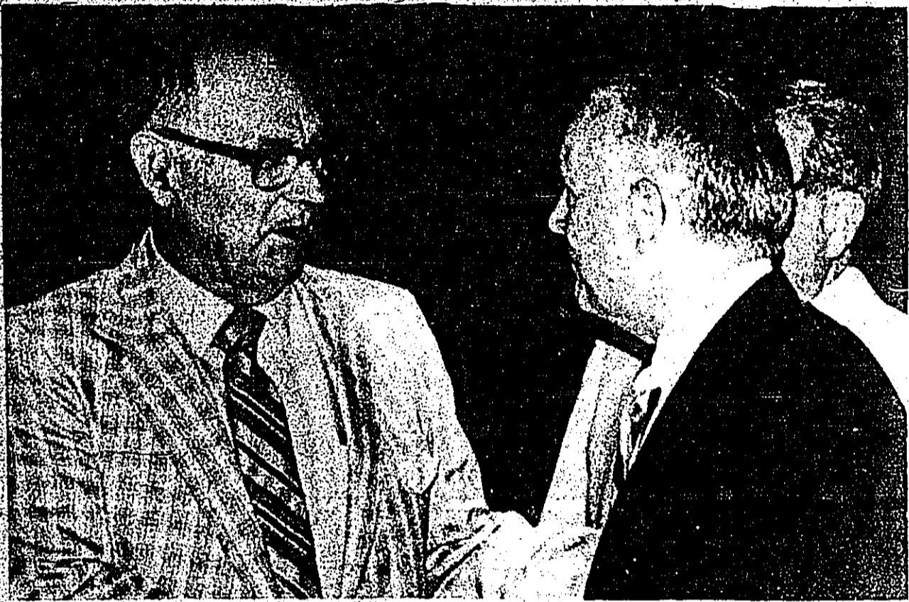
WELCOME...Governor Bill Clements allowed a moment Friday with Tyler County Judge Allen Sturrock. Clements met briefly with "Republican supporters only" following the talk before leaving for Austin. Sturrock is a Democrat.