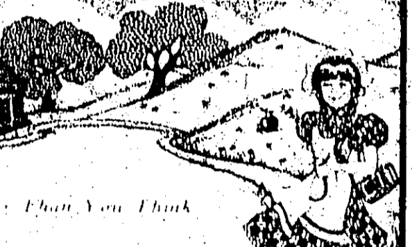
It's Later Than You Think