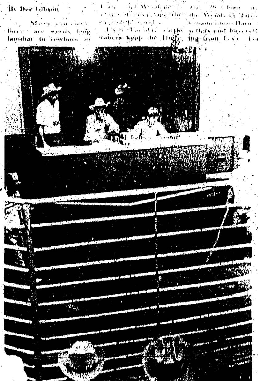
These boys are working hard to clear the way for the new highway. They are the "Move 'Em Out Boys" who are clearing the way for the new highway.

The boys are working hard to clear the way for the new highway. They are the "Move 'Em Out Boys" who are clearing the way for the new highway. They are working hard to clear the way for the new highway. They are the "Move 'Em Out Boys" who are clearing the way for the new highway.