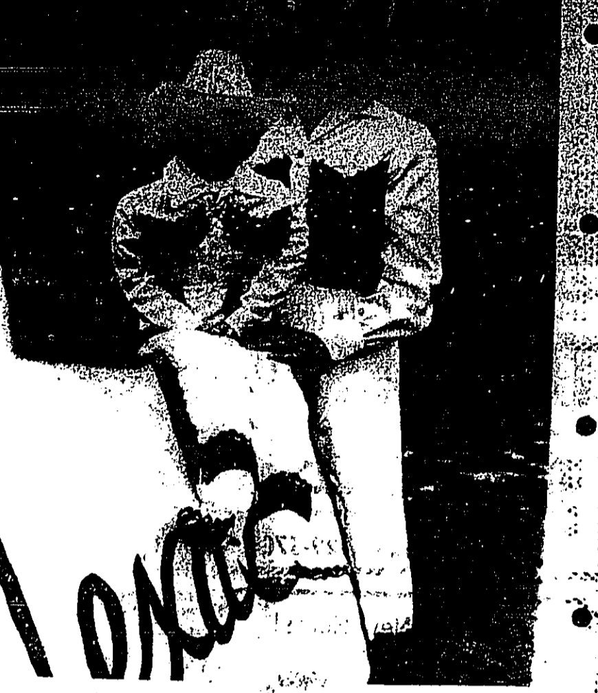
Ventriloquist And Partner