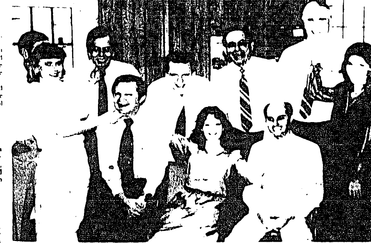
ITCHIEE, ITCHIEE, ITCHIEE...Entrants in the Tyler County Dogwood Festival Bear Growing Contest got checked out officially Monday as the male staff of Citizens State Bank got chinned by Dogwood Royalty. The event took place at Lawrence Air Conditioning.

Members of the Woodville Church of Jesus Christ of Latter Day Saints (Mormons) invite their Tyler County friends and neighbors to an Open House in their new Chapel building on Saturday, February 22, beginning at 1 p.m. The new Chapel building is located on Pine Street (Hwy 287) and has been under construction for the past year. Refreshments will be served.