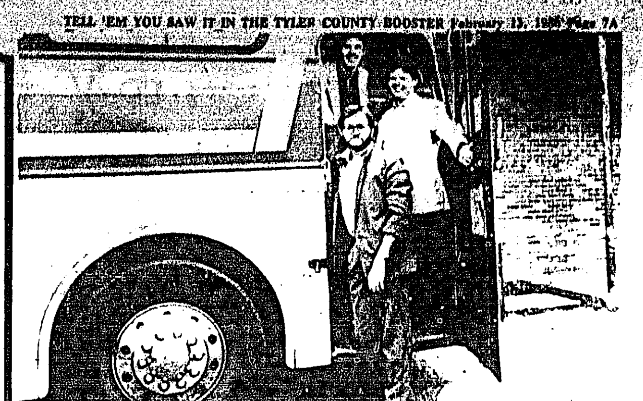
ON THE ROAD AGAIN: Acappella Ministers of Music are preparing for their next tour trip to Dallas after finishing a packed tour in Houston, Saturday, Feb. 12 at the Warren High Auditorium for the Youth Rally for Christ, sponsored by the Warren High School.