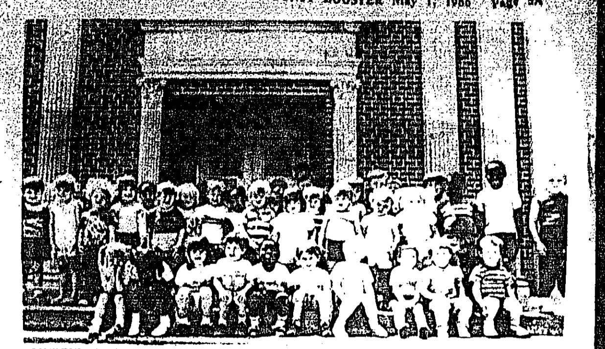
MUSCULAR DYSTROPHY BUNNY HOP... Day Care raised $910 for the ADA...