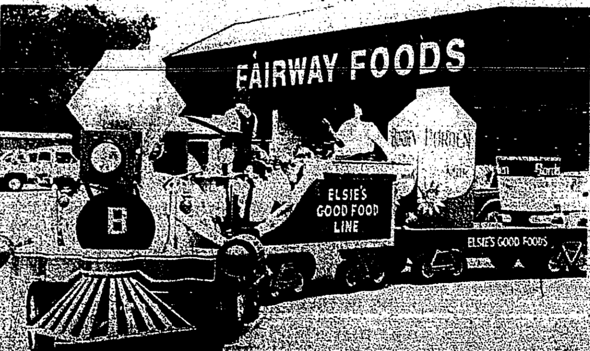
ALL ABOARD! — Fairway Foods sponsored "Elsie's Good Food Line" train which transported the food from the Fairway Foods Country Day Camp Center and a variety of other donors to Woodville Monday. New Country Day Camp Center and a variety of other donors transported the food to the camp.

vote to improve Woodville City Streets which won by a vote total of 231 for to 31 against. Mayor Knapp said the street improvement activities would be taken up sometimes after Jan. 1, 1989.