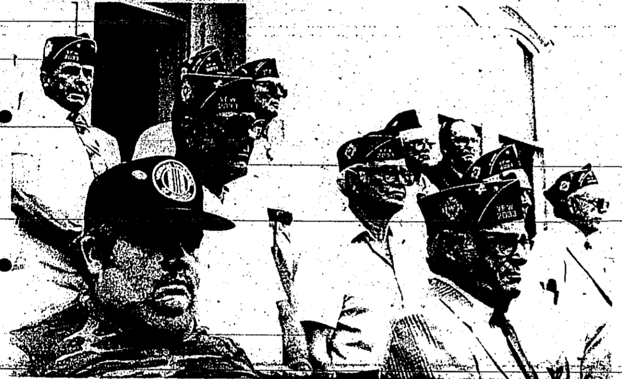
VETERANS Stand at Attention While Roll Is Called Monday