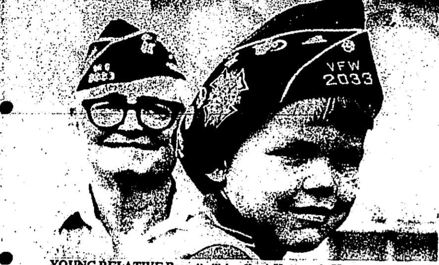
YOUNG RELATIVE Proudly Tries On A Veteran's Hat

Thursday, June 2, 1988 Woodville, Texas 75979 Vol. 59 No. 22 2 Sections 10 Pages