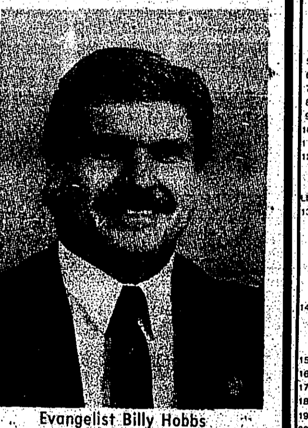
Evangelist Billy Hobbs