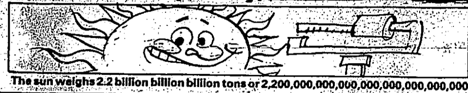
The sun weighs 2.2 billion billion billion tons or 2,200,000,000,000,000,000,000,000.