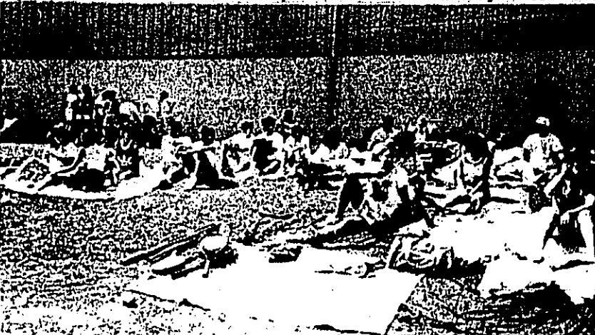
PART OF THE CROWD -Shown above are players waiting their turn, coaches, parents and friends enjoying the Woodville tennis tournament and the sun.