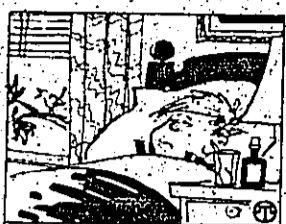
Hay fever and similar allergies cause about two million lost school days a year.