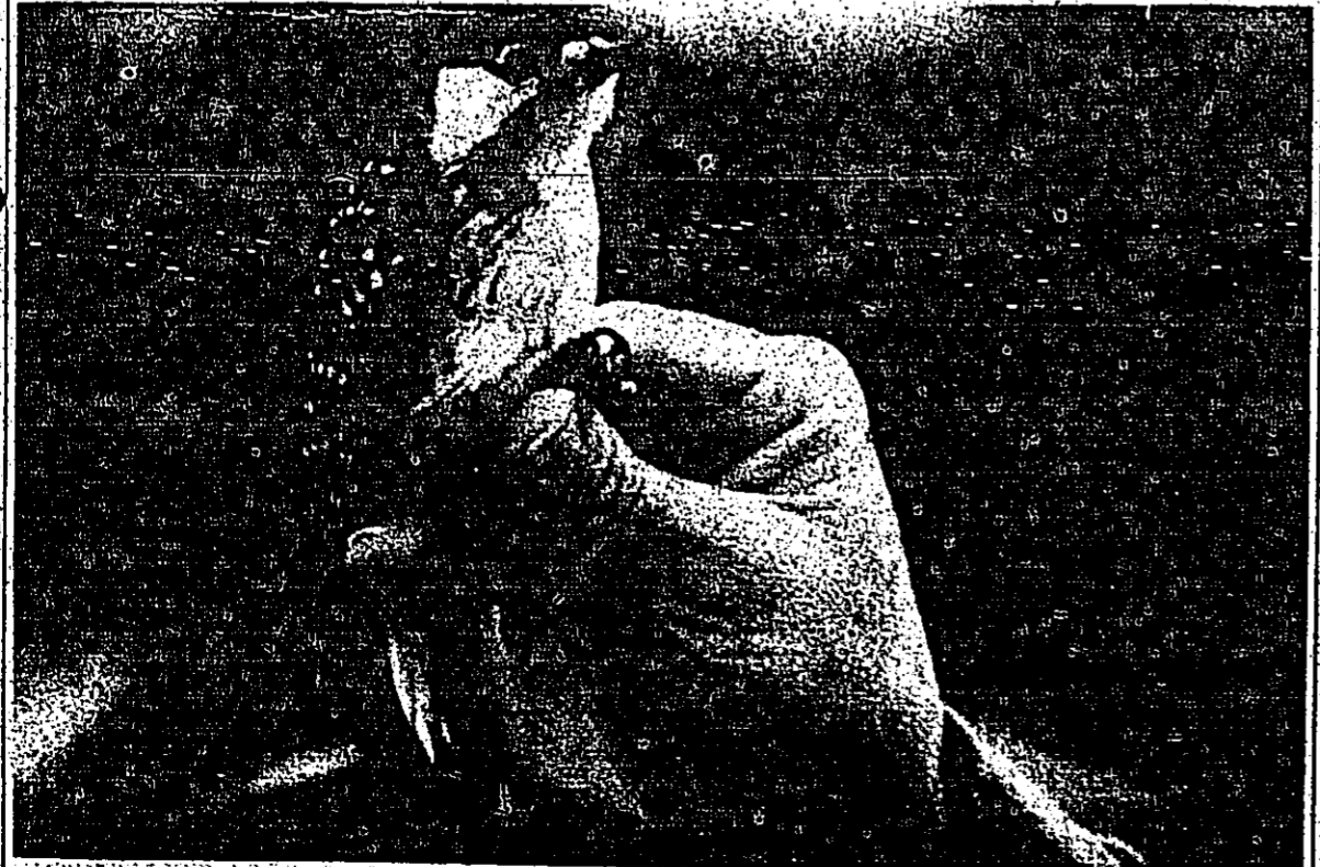
Red Cockaded Woodpeckers Need Love Too!

Complete applications must be in the Area Agency on Aging office no later than 5 p.m. on March 30, 1990. For further information, contact Holly Anderson or Ethel Bluit to the Deep East Texas Area Agency on Aging office, 203-A South Main Street, Jasper, Texas 75951 or call 409-384-9085.