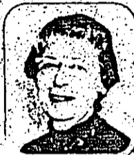
By Patsy Duke

The final weekend of the Tyler County Dogwood Festival began Saturday at 2:00 p.m. with the Tyler County Dogwood Festival Parade. The parade traveled east on Highway 190 West to the traffic light at the intersection of Highway 69 where it turned north. The lovely ladies vying for the queen's crown and their escorts, the bands and the floats paraded through the streets of Woodville. This writer turned completely proud grandmother as the float carrying her two granddaughters, Jennifer and Crystal Duke, ages 6 and 10 passed by. The clowns, the balloons, the humor depicted in some floats, the loveliness in others made this a beautiful parade and gave the spectator a glimpse of the dedication of the Tyler County residents. Each entry was special.