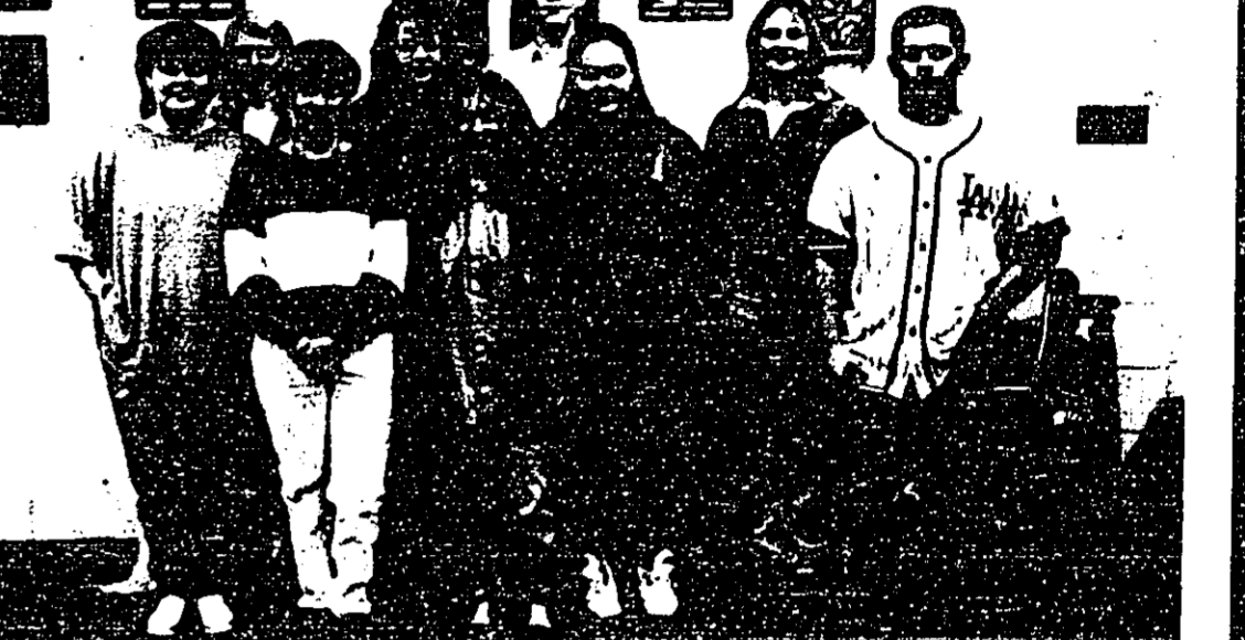
WHS REGION BAND MEMBERS — Six members of the Woodville High School Band who advanced from regional tryouts in November traveled to Diboll Jan. 9 to compete in area auditions for the ATSSB band...