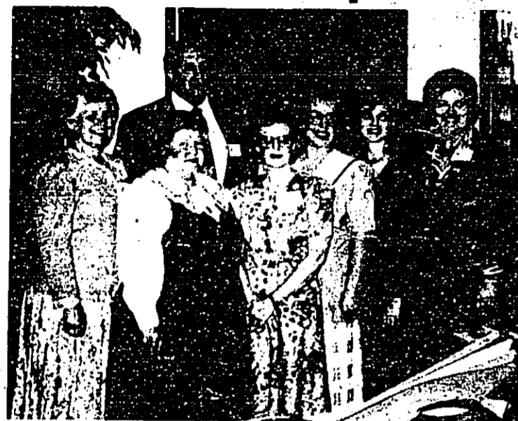
TEACHERS PRESENT PROGRAM — A group of eight teachers and administrators from Woodville Middle School presented programs during the first annual PSI conference hosted by the Texas Education Agency in Austin.

AUSTIN — A program titled "Interdisciplinary Teaching: Process and Product," was presented by a group of Woodville Middle School teachers and administrators during the first annual PSI Conference hosted by the Texas Education Agency in Austin.