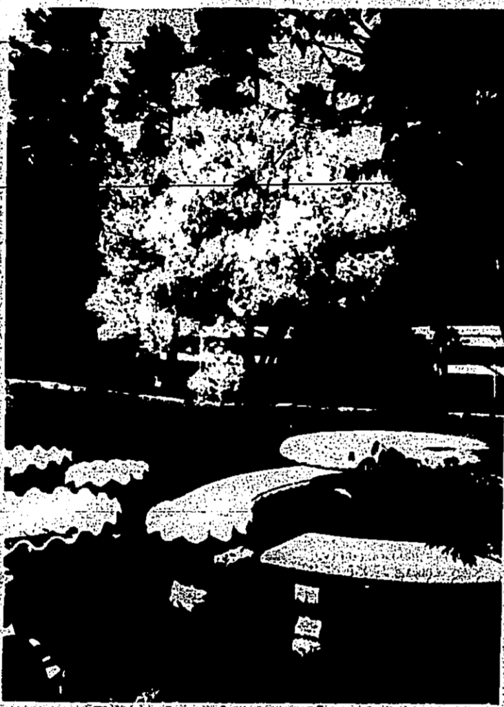
Popular decorative tree The Graybeard tree, such as this one at the Whispering Pines Nursery in Woodville, are popular landscaping items in East Texas.