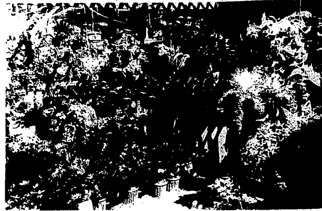
A wide variety of spring flowers and plants are now available at area nurseries, such as those pictured here at the Whispering Pines Nursery in Woodville.

Insects. There are two classes of bugs that may attack trees and plants. The first is 'sucking' and can be killed by hitting each individual with insecticide (spray or dust). The second is 'chewing' and will eat plant tissue and is best controlled by poisons which they take into their stomachs.