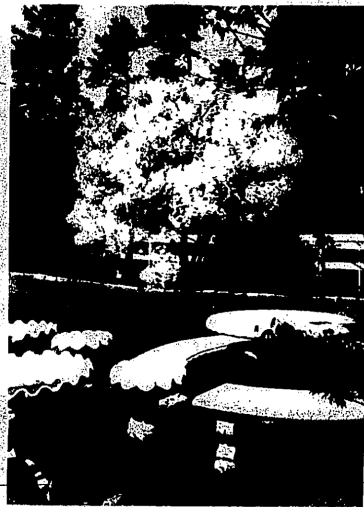
The Grancy Greybeard tree, such as this one at the Whispering Pines Nursery in Woodville, are popular landscaping items in East Texas.