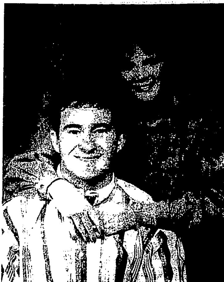
August wedding set

WOODVILLE — Members of the Women's Reading Club, their spouses and guests, met May 3 at the Industrial Arts classroom building at Woodville High School, to view the many varied pieces of fine furniture totally designed and built by students.