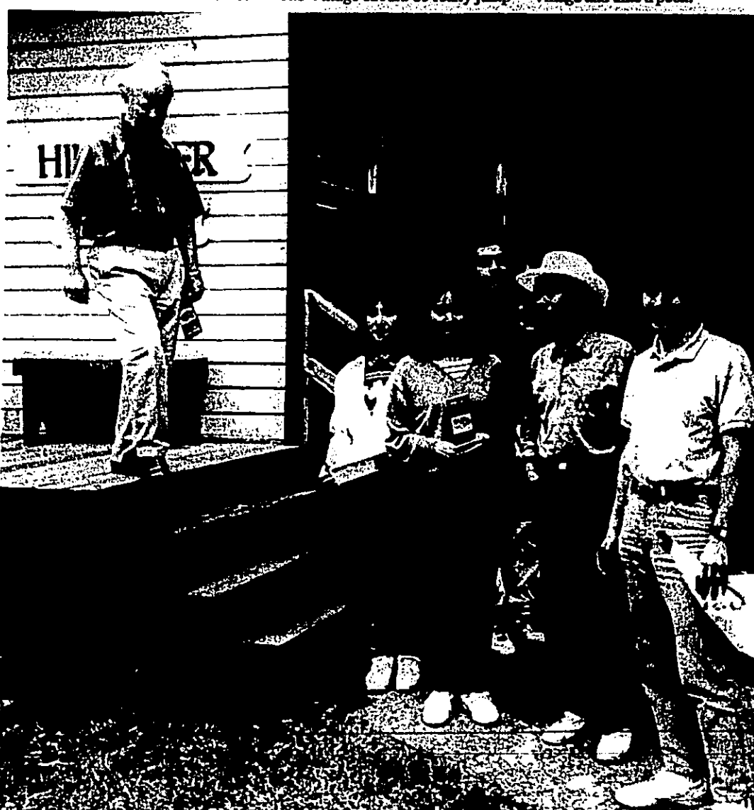
STUDY EXCHANGE GROUP VISITS — A group of four young business professionals and a Rotary Club team leader from Japan visited Heritage Village in Woodville last week as part of a study exchange project.

FRED — The date for Fred Elementary's Field Day has been changed from Friday to Thursday, May 19.