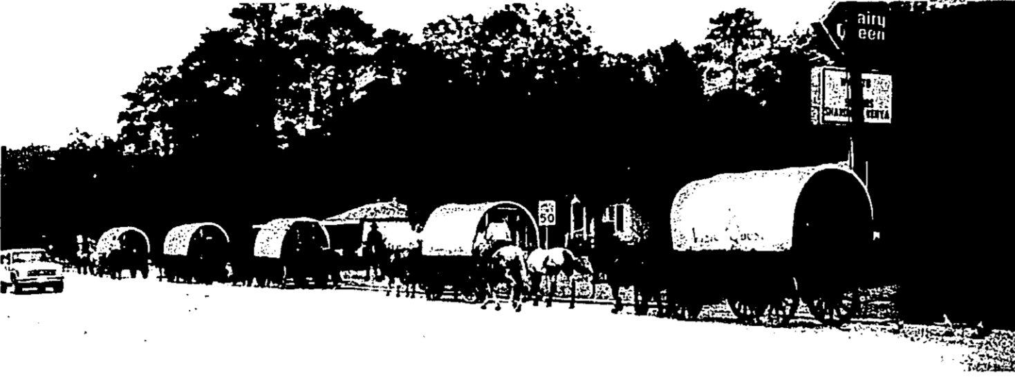
MOVING INTO TOWN — The VisionQuest wagon train moved through Woodville Monday morning enroute to a camp site at the Tyler County 4-H and FFA Rodeo Arena. The wagon train program provides a learning experience for troubled youngsters in an effort to redirect their lives.