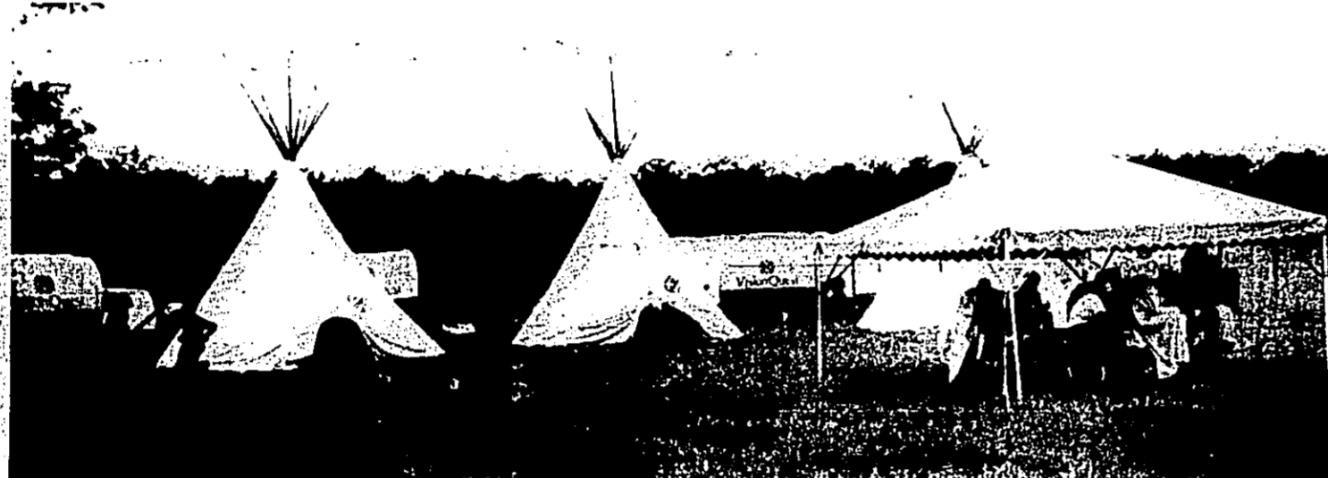
CAMP SITE — Indian-style tipis provide shelter for the youngsters in the VisionQuest wagon train program. This group of 45 camped Saturday at Lake Tejas in Tyler County, Sunday at Doucette and Monday and Tuesday at the Tyler County 4-H and FFA Rodeo Arena near Woodville.