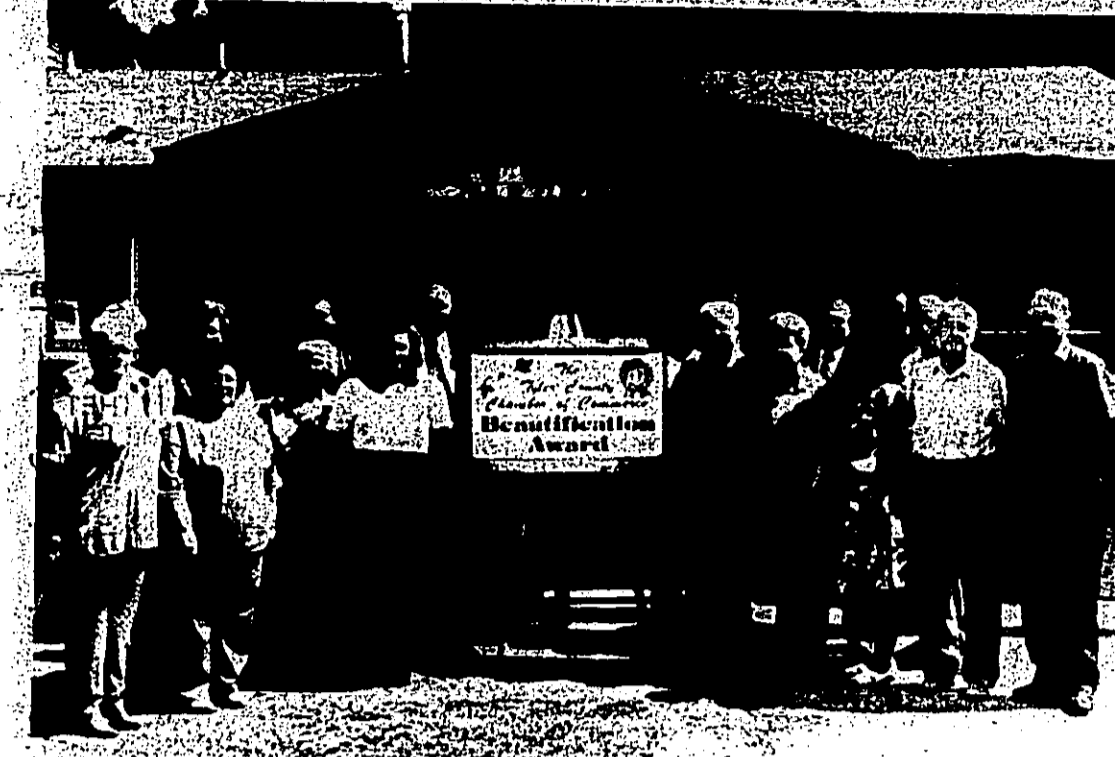
CITY HALL WINS BEAUTIFICATION AWARD — Colmesneil City Hall was the winner this month of the Tyler County Chamber of Commerce's Beautification Award. City employees and guests and officials from the Tyler County Chamber of Commerce were on hand to mark the presentation of the Beautification Plaque which sits in front of city hall.