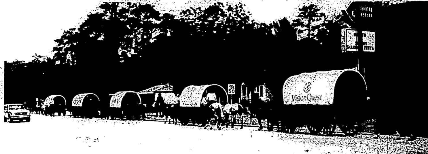
MOVING INTO TOWN — The VisionQuest wagon train moved through Woodville Monday morning en route to a camp site at the Tyler County 4-H and FFA Rodeo Arena. The wagon train program provides a learning experience for troubled youngsters in an effort to redirect their lives.