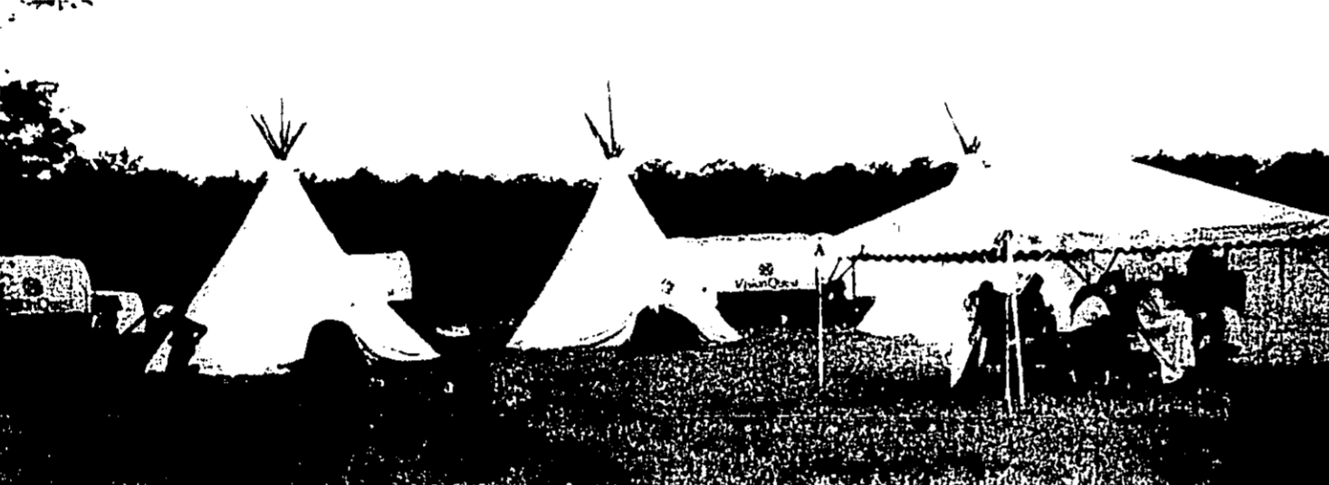
CAMP SITE — Indian-style tepees provide shelter for the youngsters in the VisionQuest wagon train program. This group of 45 camped Saturday at Lake Tejas in Tyler County, Sunday at Doucette and Monday and Tuesday at the Tyler County 4-H and FFA Rodeo Arena near Woodville.