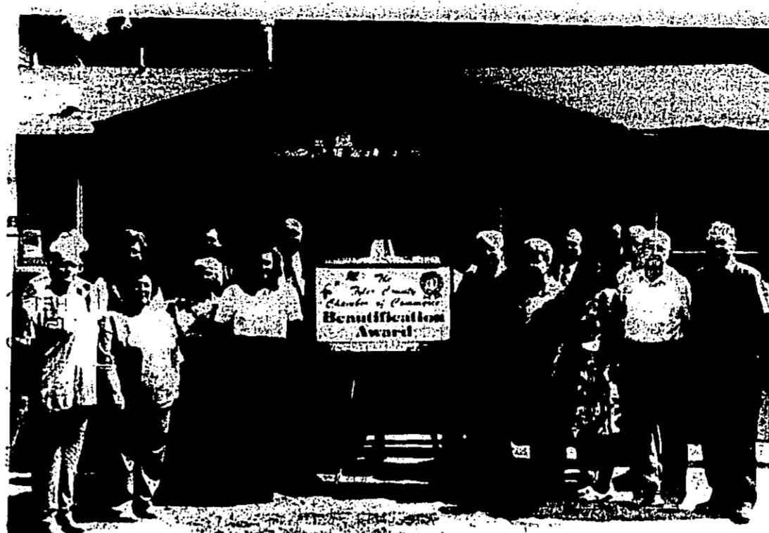
CITY HALL WINS BEAUTIFICATION AWARD — Colmesneil City Hall was the winner this month of the Tyler County Chamber of Commerce's Beautification Award. City employees and guests and officials from the Tyler County Chamber of Commerce were on hand to mark the presentation of the Beautification Plaque which now sits in front of city hall.