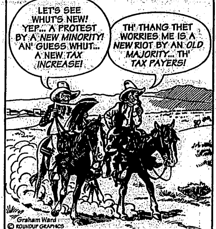
By Graham Ward